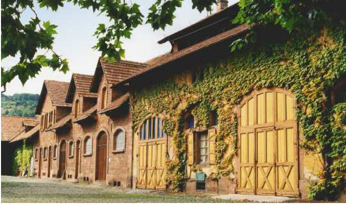
The winery portion of the Italian style villa at J.L. Wolf