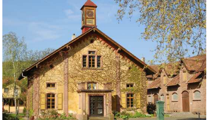
The J.L. Wolf carriage house