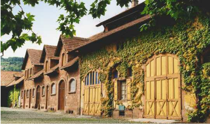
The winery portion of the Italian style villa at J.L. Wolf.