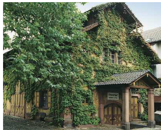
J.L. Wolf wines are made in the 19th-century winery building at the historic estate in the village of Wachenheim.